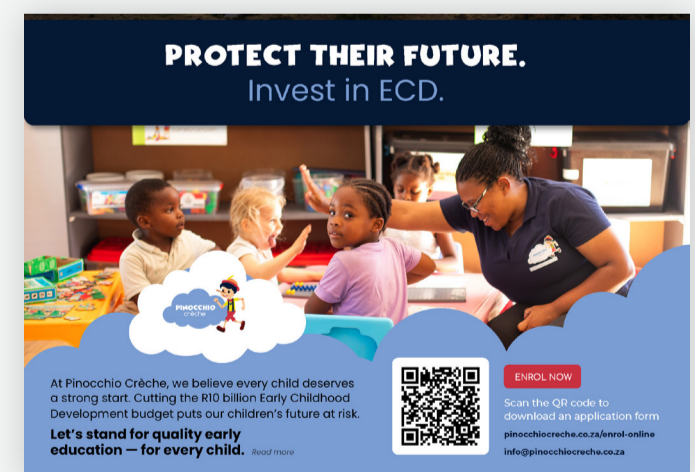
HALF PAGE 200mm (w) x 138.5mm (h) (Video allowed)

Ts&Cs Apply - All contributions to be vetted by Chief Editor | Additional fee due for copy and image creations | All pricing is ex VAT | Subject to availability space.