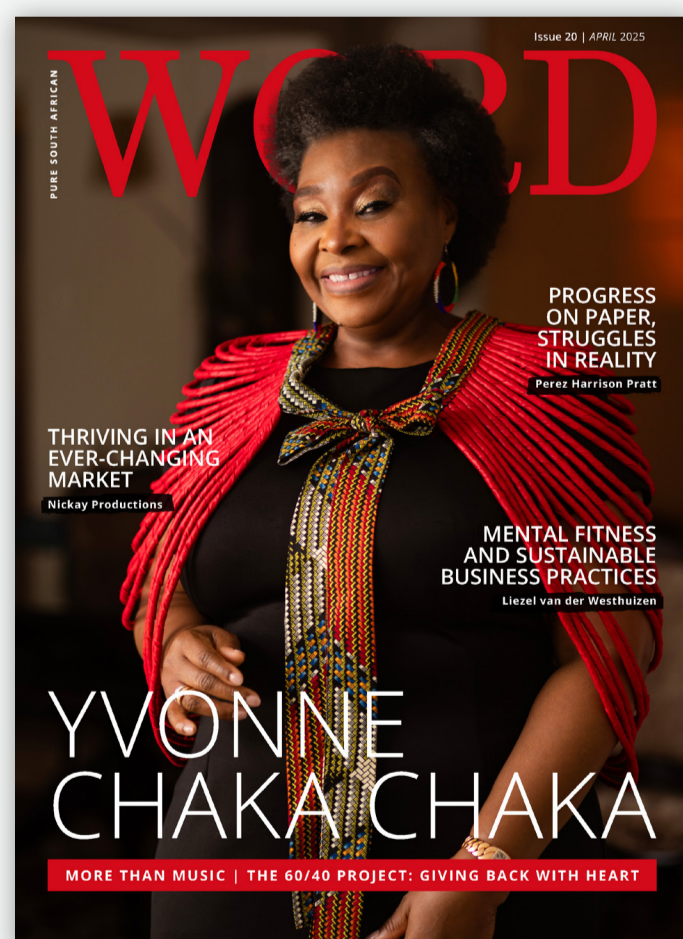
FRONT COVER 200mm (w) x 277mm (h)