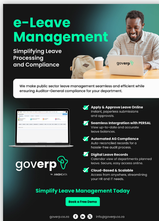
FULL PAGE 200mm (w) x 277mm (h)